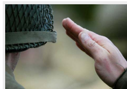
Veterans suffering from PTSD settled a class-action suit against the U.S. government to increase their disability benefits.