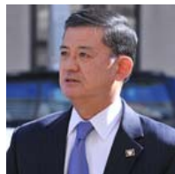
Secretary of Veterans Affairs Eric Shinseki.

The V.A. closed about 900,000 cases last year, Shinseki said, "and then we got 1 million cases back in. These are new cases, for the most part."